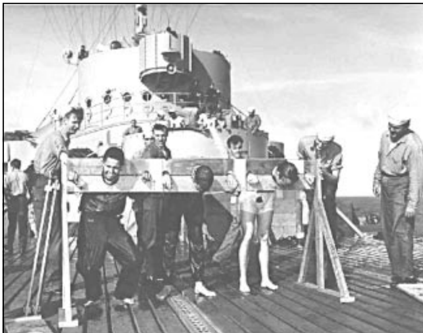
During December 1946, the seaplane tender USS Currituck AV7, ventured south toward the Antarctic Ocean from the US Naval Air station located at San Diego, CA. the voyage down the Pacific Ocean went from the earth's Northern hemisphere to the Southern hemisphere, past the Equator. Our crew of swabbies included old salts with mega years of shipboard duty, and others who were new to the rituals of equatorial enlightenment. the above photo is proof of the inhuman initiation rites meted out to "Polywogs" during the tortuous path to the realm of the "Shellback."