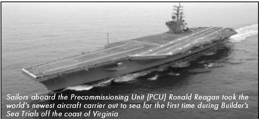
Sailors aboard the Precommissioning Unit (PCU) Ronald Reagan took the world's newest aircraft carrier out to sea for the first time during Builder's Sea Trials off the coast of Virginia

CVN 76 was christened March 4, 2001, by its sponsor, Nancy Reagan. Vice President Dick Cheney joined Mrs. Reagan in the commissioning of Ronald Reagan July 12.